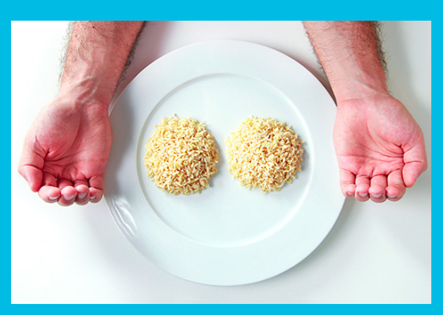
2 cupped handfuls of carb dense foods with most meals