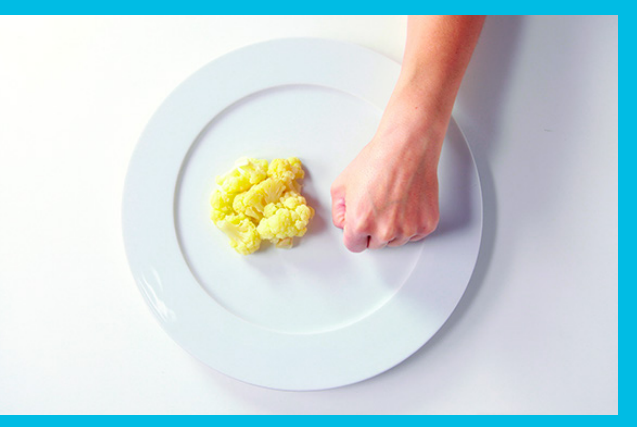
1 fist of vegetables with each meal