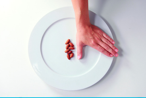
1 entire thumb of fat dense foods with most meals

Note: Your hand size is related to your body size, making it an excellent portable and personalized way to measure and track food intake.