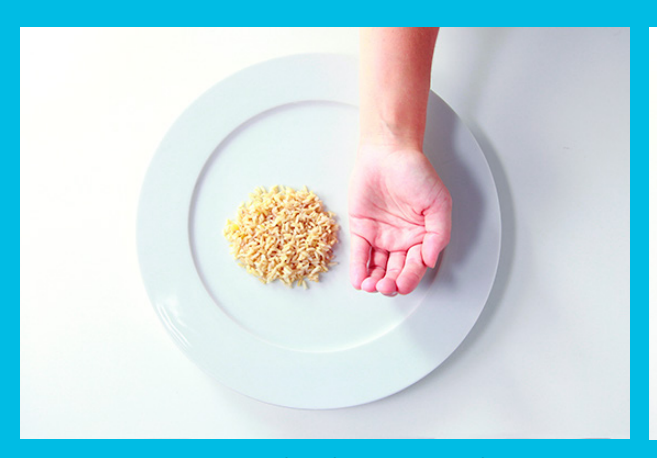
1 cupped handful of carb dense foods with most meals